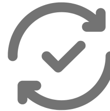
Consistent product updates