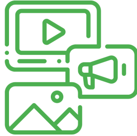
Multi-learner Tutorial Creation Tool