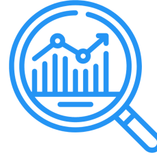
Tracking & Reporting Tool